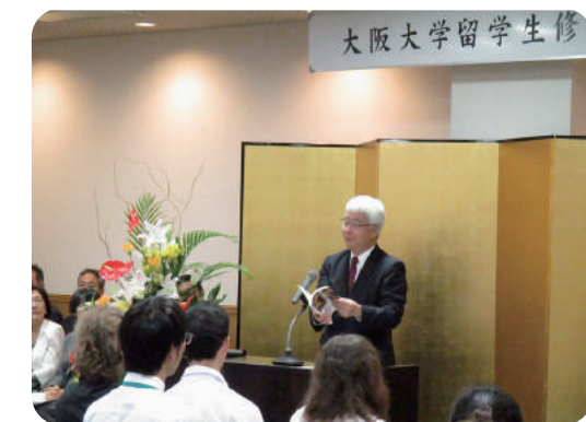
修了式ではひとりひとりに修了証が手渡されます。Each student receives a Certificate of Program Completion upon graduation.