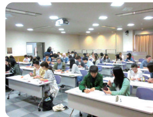
留学生活や学習の相談ができる日本人学生 (チューター) がいます。You can always count on your Japanese tutor for advice on your daily life and studies.