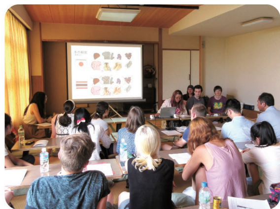
You will be studying with classmates from all over the world. 学ぶ仲間が世界中から集まります。