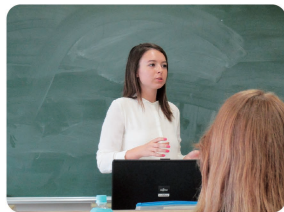
You can study Japanese culture in depth. 日本の文化を深く学べます。