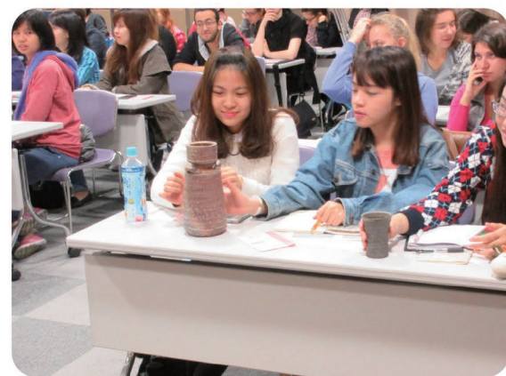
A feature of the program is its many courses. 科目数の多さが特長です。